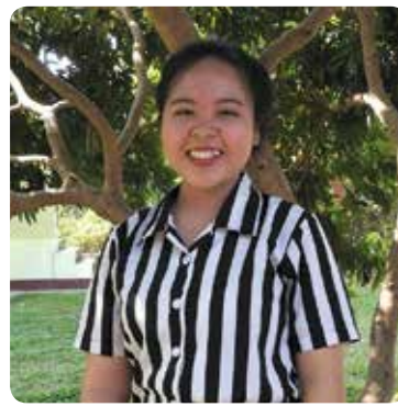
Faii School: Phitsanulok University Field of Study: Dentistry